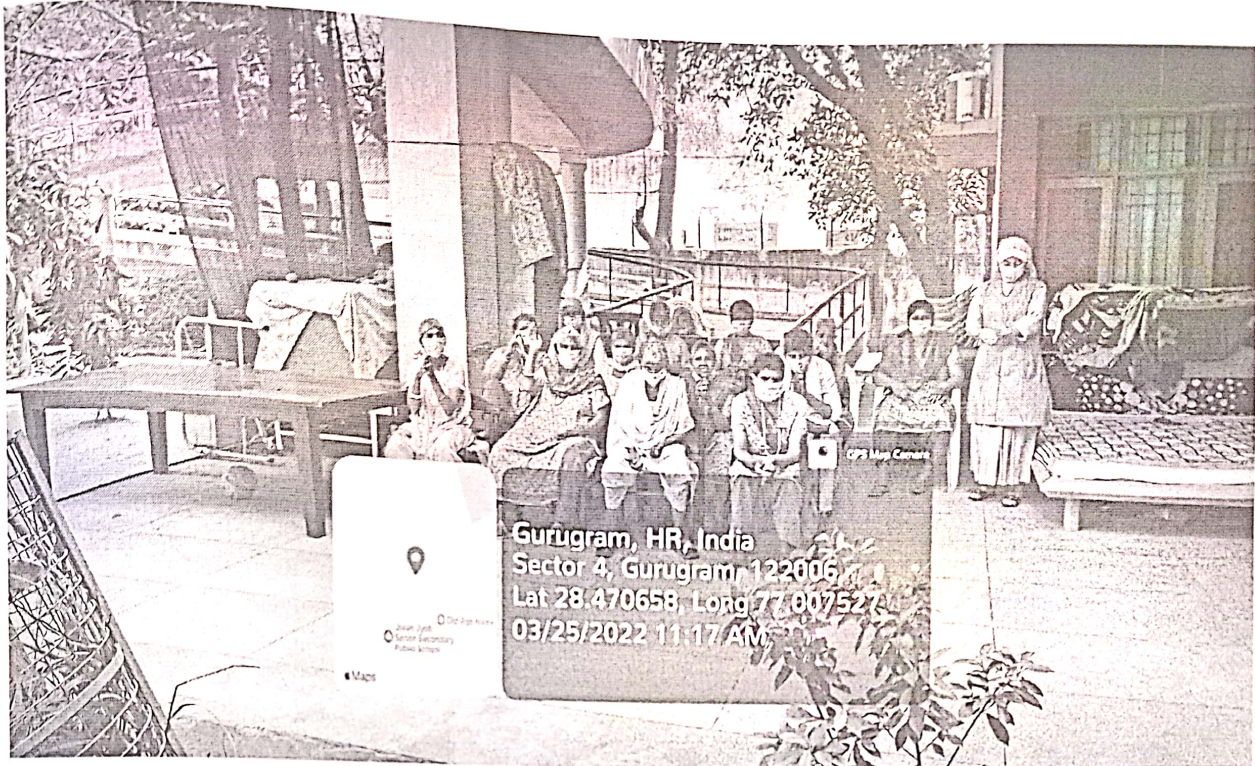
Photo 2: The elderly at Tau Devi Lal Old Age Home with whom School of Education students interacted.